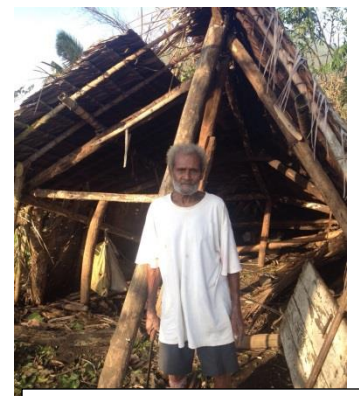
Local man standing in front of his family's home post cyclone