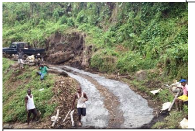
Making a new road to Megamone after the cyclone and subsequent rain washed away all access! Making use of bags of cement that would have otherwise been ruined