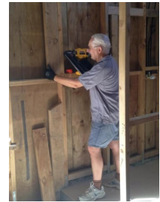
Working at V2 Life